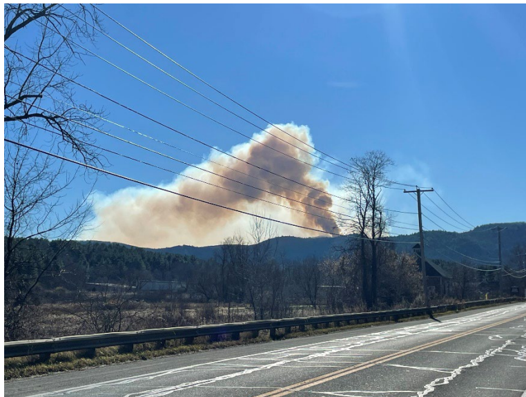
Smoke column from the Butternut Fire in Great Barrington